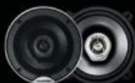
BGx 542 HP