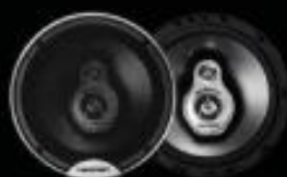
BGx 663 HP