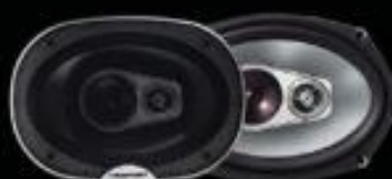
BGx 693 HP